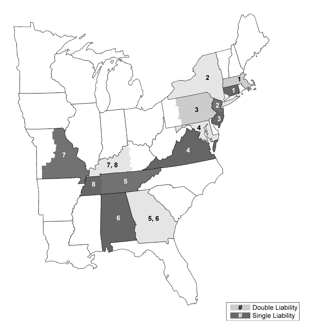
Figure 1: State-Fed district pairs

Note: The numbers identify the eight state-Fed district pairs used in the analysis. Numbers in dark font on a light background indicate districts in double liability states, while white numbers on a dark background indicate districts in single liability states. Some states, such as New Jersey, are split into two following Federal Reserve districts, with each part belonging to a separate pair. Other states, such as Georgia, serve as control for two single liability states.